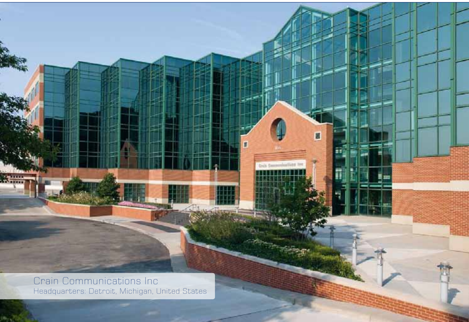
Crain Communications Inc Headquarters: Detroit, Michigan, United States

Crain only publishes material if it passes these stringent tests—establishing the company with an unrivaled reputation for information-rich reporting. This, in turn has attracted readers who want independent and insightful analysis of their respective industries. It has helped build a readership unmatched in the industry including the most senior executives and decision-makers. And it gives advertisers a preeminent opportunity to reach these key decision-makers in their expanding global businesses. The company’s guiding principles have proven to be both strong and influential.